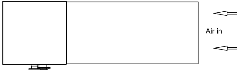
Standard Connection and Access Side

Rev. Date 10/03/04 / EWKD 144 c/w Inlet Silencer DIMENSION SHEET